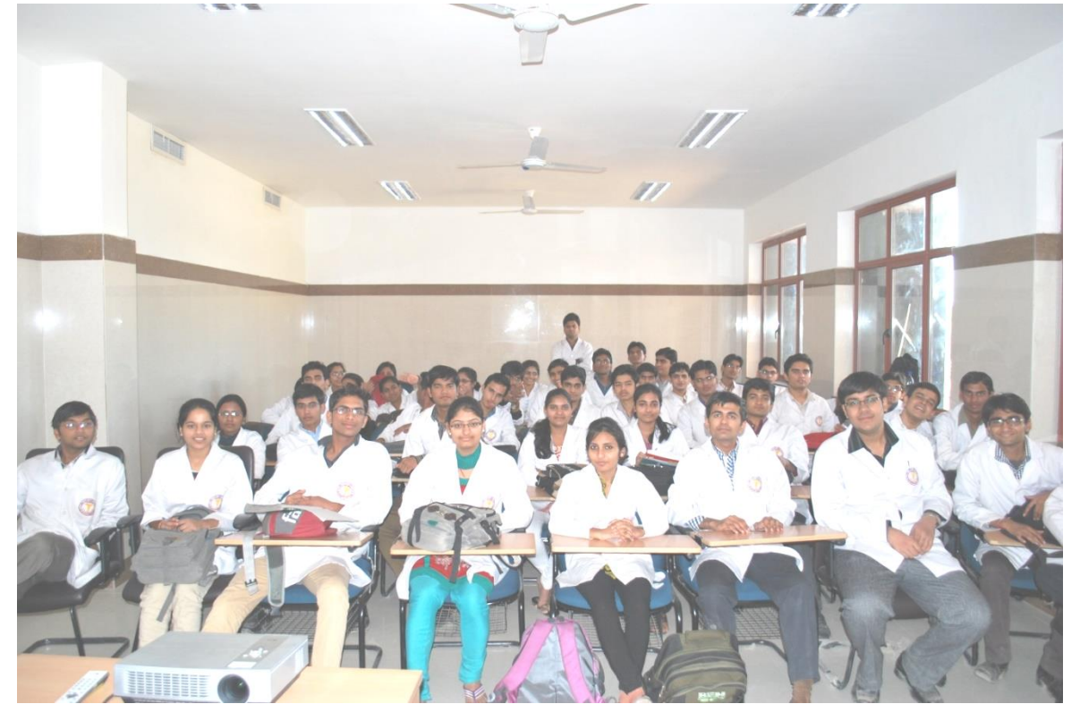
ALL INDIA INSTITUTE OF MEDICAL SCIENCES, JODHPUR

Conducted the Workshop on Undergraduate and Post Graduate Curriculum In Medical Physiology in the Department of Physiology, 25<sup>th</sup> & 26<sup>th</sup> February 2013.