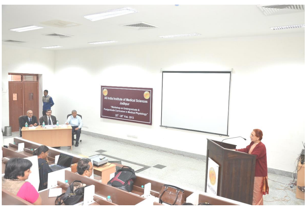
ALL INDIA INSTITUTE OF MEDICAL SCIENCES, JODHPUR

The department carries out regular formative assessments. These assessment are mostly objective. Practical assessment involves Objective Structured Practical Examination (Procedure stations and Question Stations), assessing both psychomotor and cognitive skills.