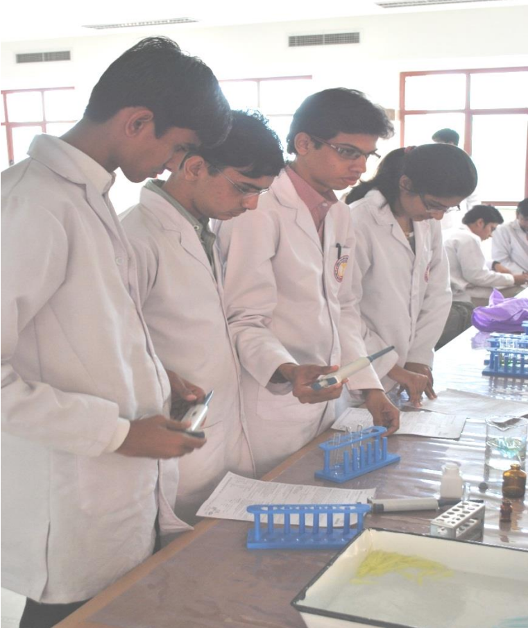
Students in Biochemistry Lab