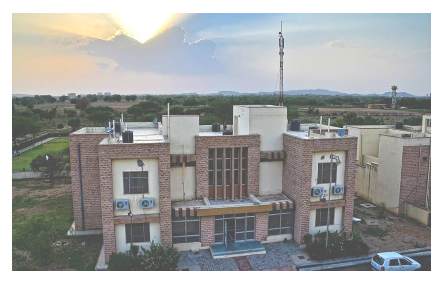
View of the Guest House

For visitors, a fully furnished guest house has been established in the residential complex. It has thirteen air-conditioned comfortable rooms with double beds and television. Kitchen facility is available in the guest house complex with a central dining room. The kitchen provides good wholesome food to the guests.